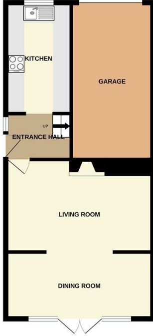
GROUND FLOOR 566 sq.ft. (52.6 sq.m.) approx.